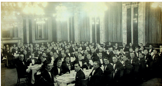
OPC Annual Dinner c.1930