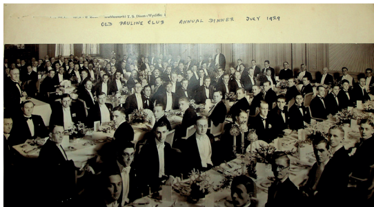
OPC Annual Dinner 1929