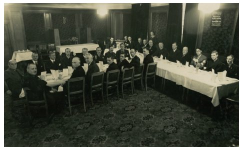
Old Pauline Club - Occasional Dinner after Annual General Meeting 1939