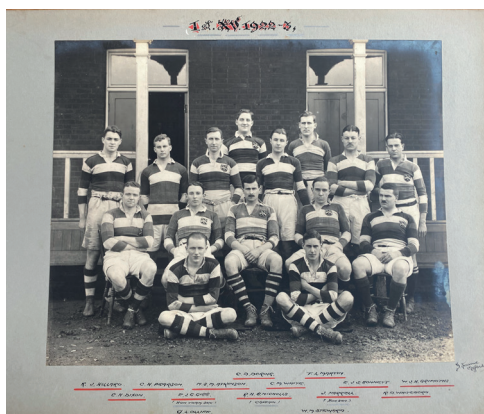
OPFC 1st XV 1922-23