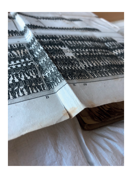
The School's copy of Thomas Clarkson's The History Of The Rise, Progress And Accomplishment Of The Abolition Of The African Slave-Trade By The British Parliament Volume II published 1808.