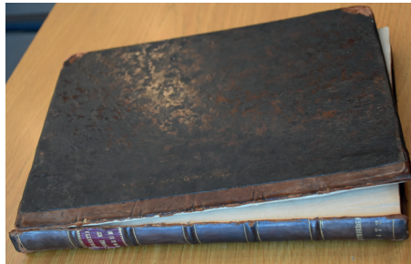
Pharetra Doctorum Philosophorum Et Poetrum