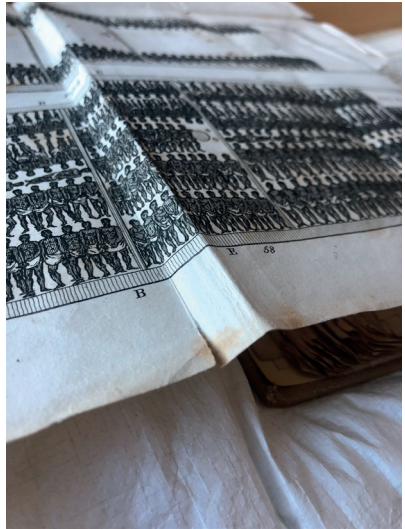
The School's copy of Thomas Clarkson's The History Of The Rise, Progress And Accomplishment Of The Abolition Of The African Slave-Trade By The British Parliament Volume II published 1808.